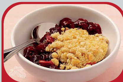
Hot & cold desserts e.g. Plum & cherry crumble