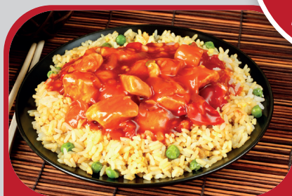
Cultural cuisine e.g. Sweet and sour chicken