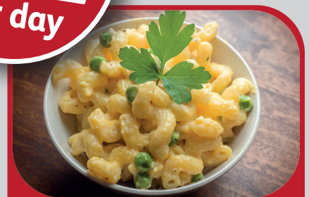
Vegetarian e.g. Macaroni cheese