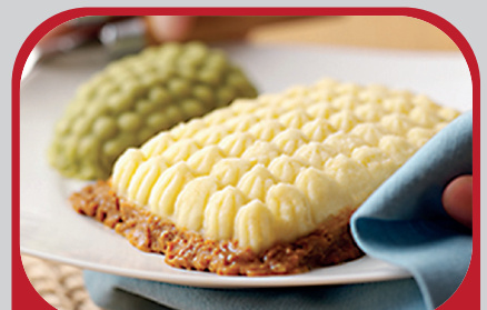
Puree & soft meals, e.g. Cottage pie