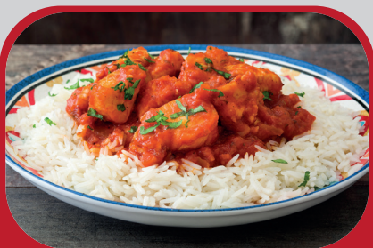
Halal meals e.g. Chicken tikka masala