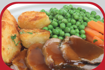
Traditional meals e.g. Roast dinner